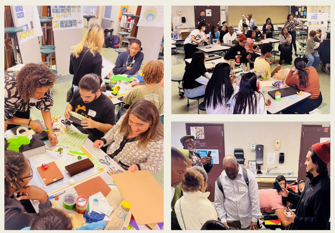
Oakland, Calif.-based TAY, including young people with lived experience of housing insecurity, participated in charrettes, informing the design and planning of the Career and Technical Education TAY Hub.

Concurrently, there is a large advocacy coalition based in the city of Oakland, in California's Alameda County, that is pushing for a more connected and expansive TAY support system. Each year, approximately half of Oakland Unified School District graduates do not enter post-secondary programs. The coalition is centered around a place-based intervention that brings together housing and education partners. They hope it will lead to a transformation in how Oakland's TAY housing assistance system operates. Known as the Career and Technical Education TAY Hub (aka "the CTE TAY Hub"), the project seeks to leverage property owned by the public school district to develop a center for TAY housing, educational, social and employment opportunities. Through the generous investments of local private foundations, paid youth advocates have been critical to the CTE TAY Hub's planning. This includes addressing what happens to TAY who graduate from the time-limited housing services offered, and identifying resources for TAY who will not be able to access the CTE TAY Hub's housing services because of finite space.