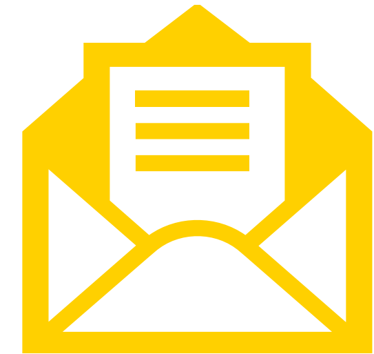
Notification of Selection