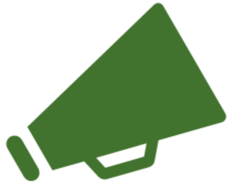
Call for Applications